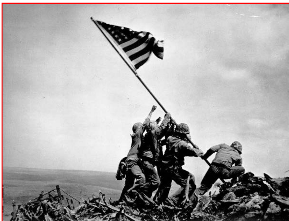
Flag Raising on Iwo Jima February 23, 1945