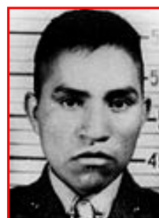
Ira Hayes U.S. Marine Corporal