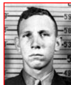
Harlon Block U.S. Marine Corporal