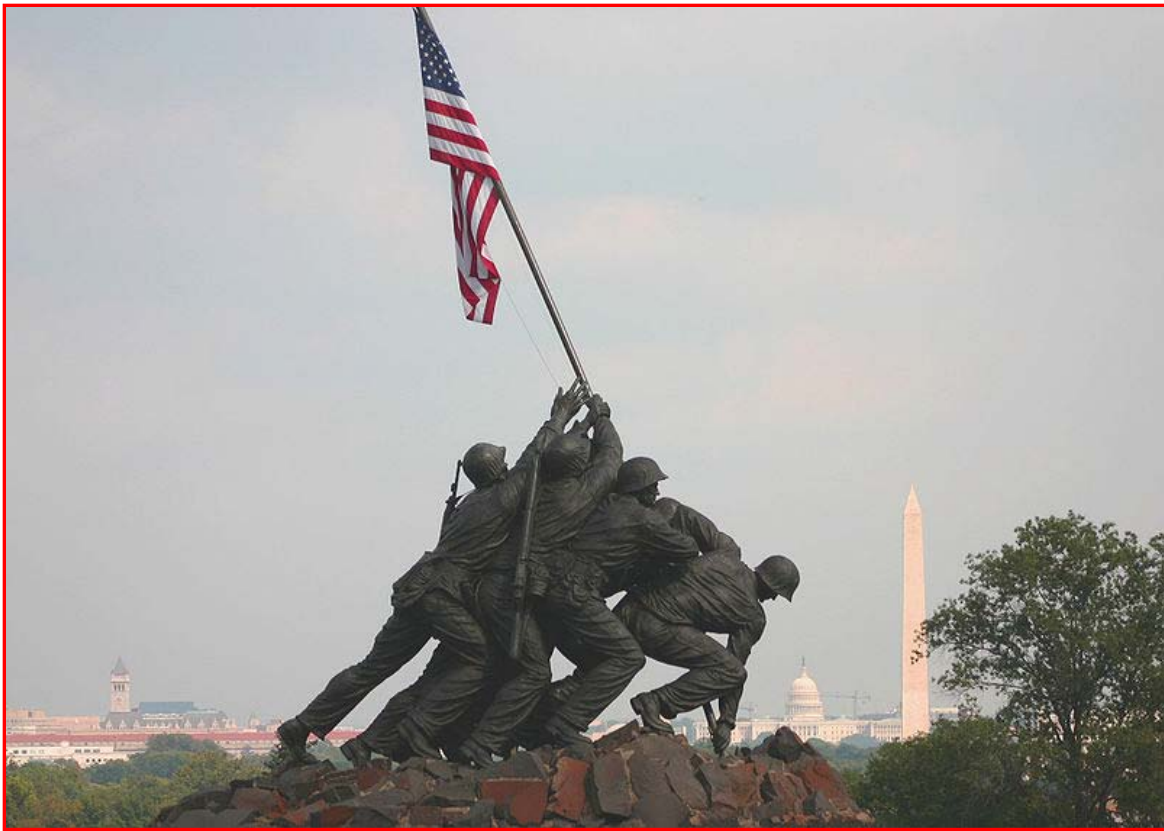
Marine Corp Memorial with Washington DC in the distance