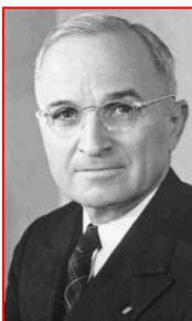
Harry S. Truman President 1945-1953

President Truman hosted the flag raisers at the White House.