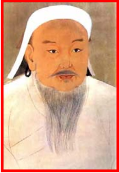
John Wayne as Genghis Khan? Click here and scroll down to see photo.

Korea and China -- disappeared from all eight junior high history books approved by the national government Tuesday. One book maintained a reference to wartime "comfort stations" for Japanese soldiers."