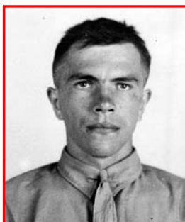
Michael Strank U.S. Marine Sergeant Squad Leader