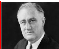
Franklin D. Roosevelt President 1933-1945

President Roosevelt died less than three weeks after the Battle of Iwo Jima. It was his idea to use the flag raisers to raise money for war bonds.