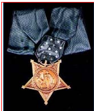
U.S. Navy Medal of Honor photographed about 1945.

"The Medal of Honor is the highest award for valor in action against an enemy force that can be given to an individual serving in the Armed Services of the United States. Although originally awarded for both combat and non-combat heroism, the Medal of Honor today is presented for conspicuous gallantry and intrepidity at the risk of life, above and beyond the call of duty." U.S. Naval Academy definition. (This medal is sometimes erroneously called the "Congressional Medal of Honor.")