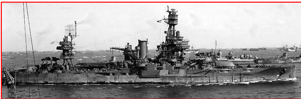
Photo at left: The USS Texas “lent gunfire support and anti-aircraft fire to the landings on Iwo Jima and Okinawa.” From Historic Naval Ships Association Web site. Click here to see a beautiful color print of USS Texas firing on Mt. Suribachi!

Heart of Texas Young Marines: Excerpt about Iwo Jima: “The Nation will never know the number of bomber air crews this tiny island saved. Without Iwo Jima, bombing of the Japanese home islands would perhaps have extracted a prohibitive price. Both the Marines and certainly the Japanese knew the value of this desolate, forbidding mound of volcanic sand and rock. Each fought intensely; one side to guard its Empire and the other to extinguish that Empire.”