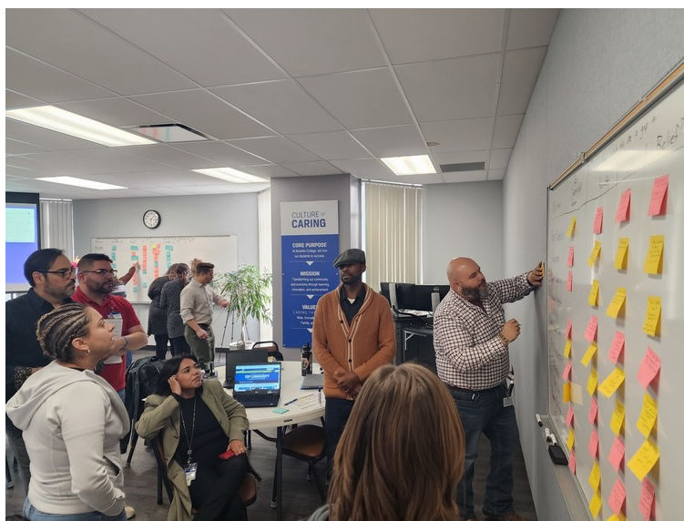
Inside Track Coaching Training at AC