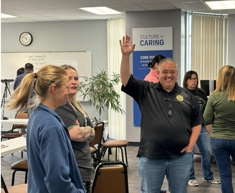
Teaching for Transformation 5