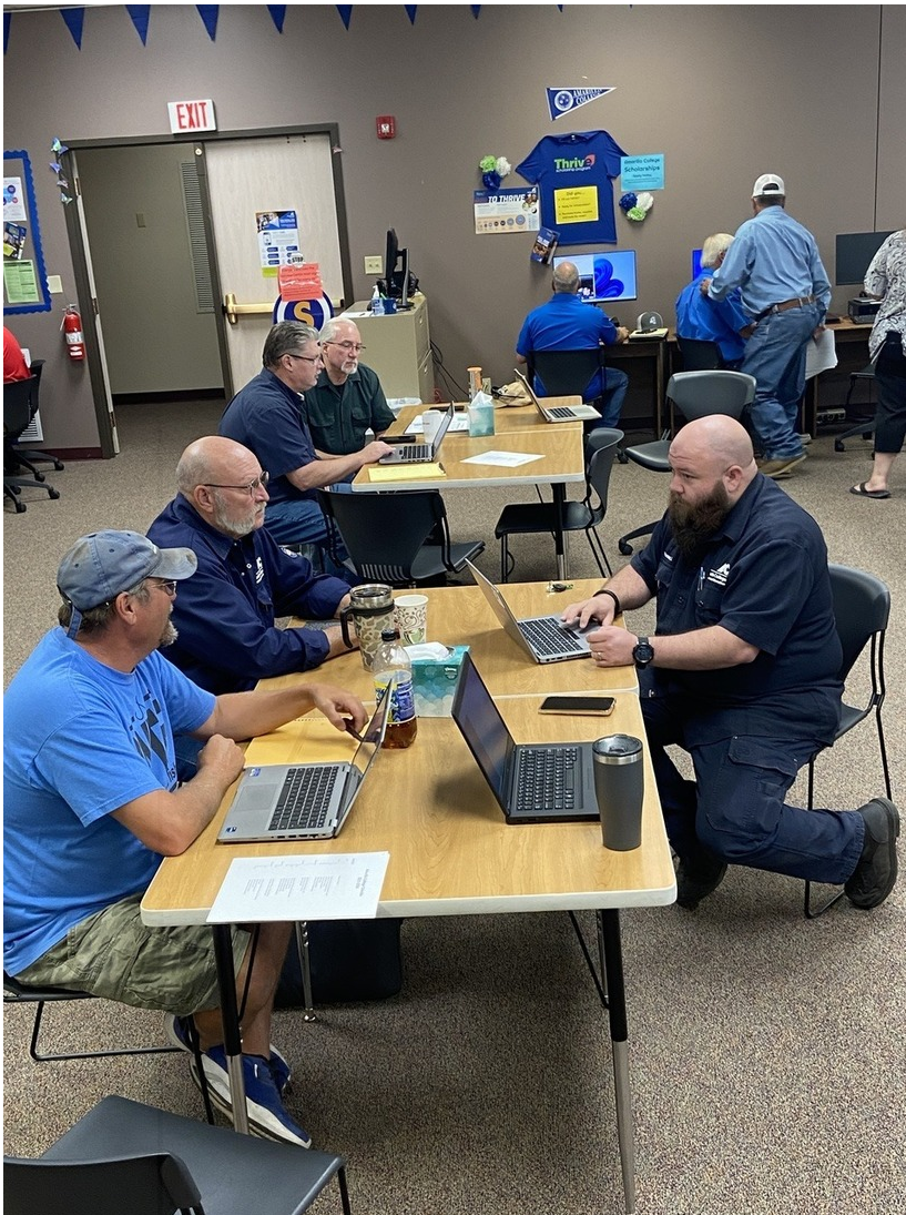
BB Ultra Troubleshoot at East Campus