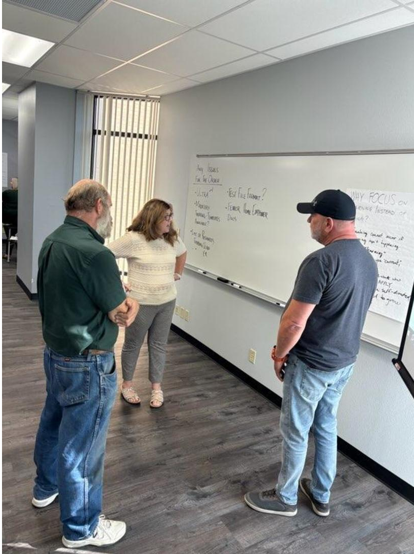
Teaching for Transformation 5