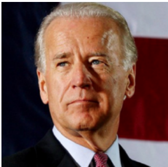
Joe Biden - Democrat joebiden.com