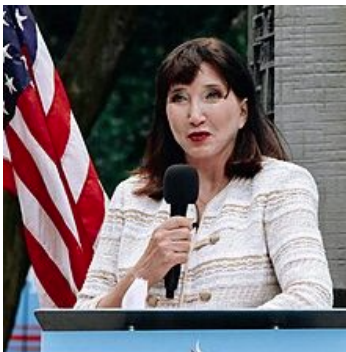
Jo Jorgensen - Libertarian jo20.com