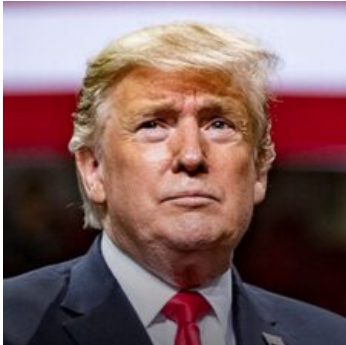
Donald Trump - Republican (Incumbent) donaldjtrump.com